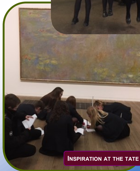
INSPIRATION AT THE TATE MODERN