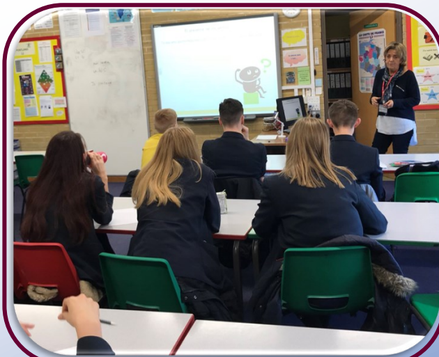
YEAR 11 SPANISH MASTERCLASS