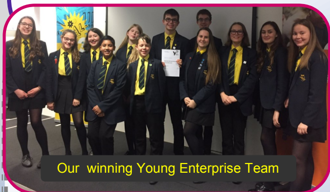
Our winning Young Enterprise Team